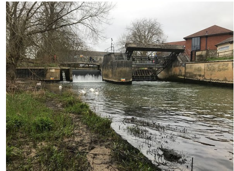
Chippenham Radial Gate

The meeting with regards to the River Avon in Chippenham was to discuss many things including the development by the river. What was clear was that the Environment Agency (EA) will be removing the Radial Gate at Chippenham. As local residents know, this gate is what gives the river its depth along a 2 mile stretch down to the Town Bridge. If this water level drops then there will be no Chippenham Sailing Club; no canoeing; no paddle boarding; no open water swimming etc. In addition of course we will be unable to run boat trips at the Chippenham Folk Festival.