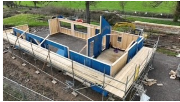
Carpenters Workshop from the air

While we were pleased that the panels are finally on site, we were somewhat disappointed that not all the panels went fitted. The panels for the West side were simply left nailed to the sole plate with no other support, and panels not fitted were left inside facing up to the elements. Volunteers rectified these issues. More disappointment ensued when we were told that the roof trusses were not in the UK yet.