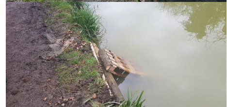
from top Carpenters Workshop from the South fencing at the Circular Spillweir the Log Store before & after a slipway for dogs!