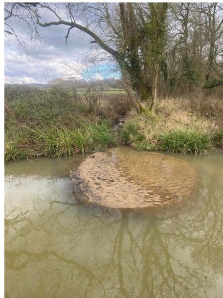
silt deposited from Hanna's Brook

Finally, the silt being deposited into then canal by Hannah's Brook has become a serious problem, which we will be dealing with as soon as possible. Looking at a longer term solution, a group of WPOs will be visiting Triangle Wood on Friday 15 March to assess possible options.