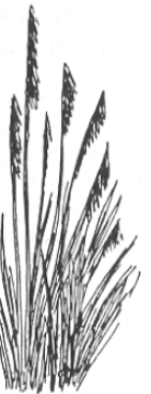
Common Reed (Phragmites)