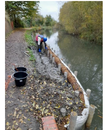
Pulling the waders out!