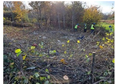
coppiced area below Double Bridge

Why not come along and help us plant the trees, especially if you contributed to the fund. You'll be able to see exactly what the fund has enabled us to do. Contact howard.yardy@wbct.org.uk