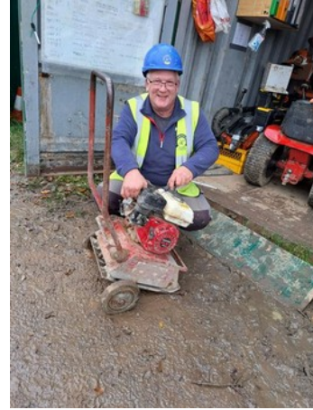
keeping our kit in good, safe working order