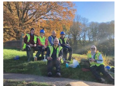
volunteers having lunch at Double Bridge