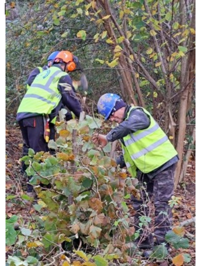
dead hedge building

Last year there were lots of dead bodies and nest failures as a result of the extremely hot weather. This year only one box had a brood that had died and two thirds of the boxes had been used.