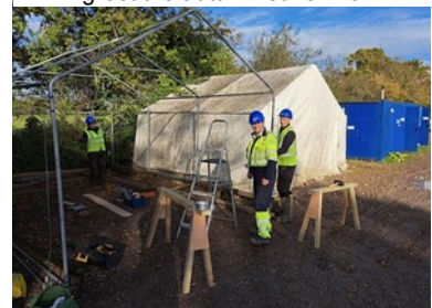
from just a framework (above) to a complete secure storage unit (below)