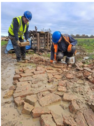
preparing the brick base for the Works Compound resurfacing