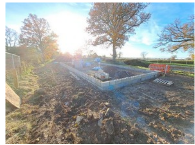
the blockwork of the Carpenters Workshop rises out of the ground to greet the autumn sunshine