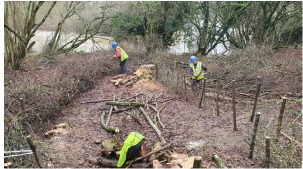
coppicing next to the swollen River Avon

Hazel trees in this woodland are being felled as part of the overall management of this area. This is called coppicing and is a traditional method of extending the life of hazel trees. The wood will be used for a variety of purposes. By cutting back the tree, light is allowed to reach the ground. Woodland flowers will start to grow and feed insects and birds. The tree stump will sprout many shoots in the spring and eventually providing nesting sites for birds and habitat for butterflies and moths. Remnants of the tree (brash) will be used to create a dead hedge to protect the new growth from deer browsing. This structure will also be exploited by wildlife. Only a few trees per year will be cut to create a mosaic of habitats. If you would like to help with this project, please contact the Trust at Howard.Yardy@WBCT.Org.UK.