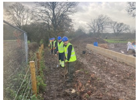
the new hedge at Pewsham Locks