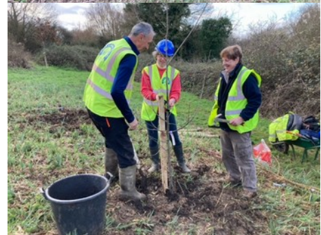
tree planting at Naish Hill