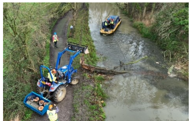
tree removed from the canal