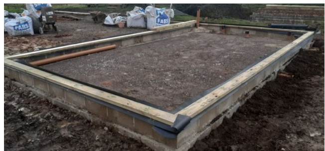
Carpenters Workshop: floor compacted and sole plate fitted

Further work has been carried out removing bricks from the East wall of the entrance to Top Lock.